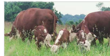
Cherry Grove Farm