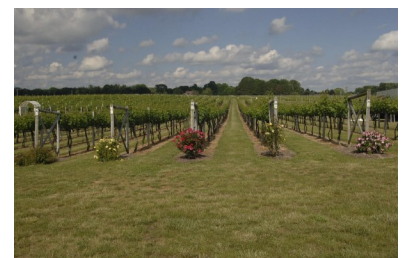
Working Dog Winery

Working Dog Winery Windsor-Perrineville Rd Robbinsville