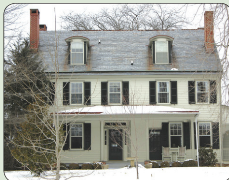
Enoch Middleton House, 2 Old York Road, Hamilton

In the North Crosswicks section of Hamilton Township, New Jersey on the corner of Church Street and Old York Road sits one such safe house. Named the Enoch