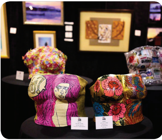
Photo from the 2018 Beyond Pink Art Show

YWCA Princeton's Breast Cancer Resource Center (BCRC) will hold its 2nd Annual 'Beyond Pink' Art Show. Beyond Pink, is an art show showcasing art created and/or inspired by breast cancer survivors. The exhibit will take place on Friday, October 4th and Saturday, October 5th at the D&R