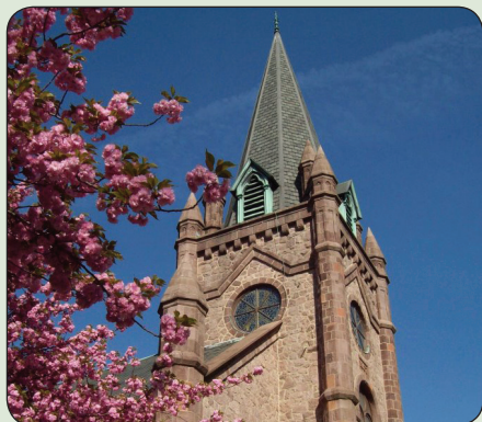
1867 Sanctuary, Ewing

The 1867 Sanctuary is a landmark Romanesque stone structure in Ewing which formerly served the Ewing Presbyterian Church congregation (founded 1709) as their fourth worship building on essentially the same footprint of land. The present stone structure was built in 1867 during a period of optimism and growth following the Civil War, and its original soaring steeple (roughly half again as high as the current one) like-