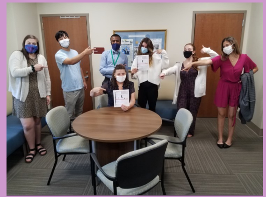
Above: The County Clerk with 2020 Summer Interns

West Windsor Municipal Complex, 271 Clarksville Rd, West Windsor, NJ, 08550 (Between the Municipal building and the Senior Center)