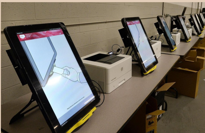
Pictured: Dominion Imagecast Ballot Marking Device

The use of early voting is extremely popular in the US because it eases Election Day congestion, leading to shorter lines and overall improved poll-worker performance as it lessens crowds of voters. Also, this process will free up election officials to correct any registration errors that arise and fix any voting system glitches earlier. Of course, you still have a choice to vote by mail or vote in person at your regular polling location on Election Day. By implementing early voting opportunities throughout New Jersey it will ensure that the voting process becomes more convenient for citizens, thereby increasing turnout and diversifying the electorate. Lastly, I would like to remind everyone to keep checking our website at www.mercercounty.org/countyclerk for updated details on this process as they become available.