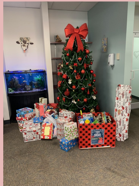
The Mercer County Clerk's Office donated a record amount of toys to the Children's Home Society of NJ and put a smile on many faces.