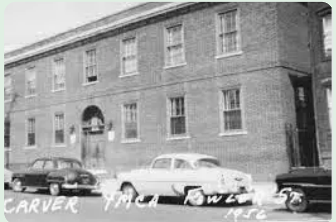
The Carver Center, 1956

scientist and inventor, was given to the Trenton YMCA in 1944 to replace its Community Branch, which had been established for Black residents in 1938 on Spring Street. The Carver Center was a social center for the community from the time of its construction, hosting nationally known performers like Cab Calloway, Ella Fitzgerald, and Fats Walker, and also served as a meeting place for organizations including the State Conference of the NAACP and the New Jersey Federation of Colored Women's Clubs. The latter organization, founded in Trenton in 1915, purchased the property in 1975. In 1981, the two-story,