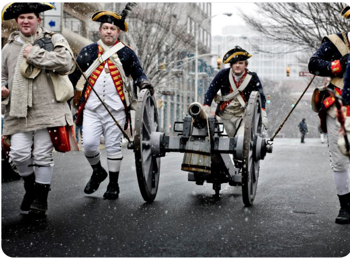
Battles of Trenton reenactment on Patriots Week

With dozens of events taking place during the week, the partnering organizations invite families and history aficionados to spend a few days in Central New Jersey this December. For more information about Patriots Week 2023, visit www.barracks.org/patriots-week.html