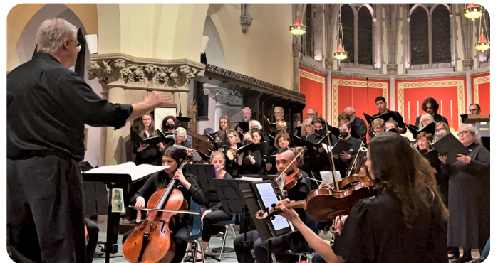
Voices Chorale NJ

Celebrate this holiday season with Joyful Reflections . The show starts at 4 p.m. at Trinity Church, located at 33 Mercer Street in Princeton. General Admission tickets cost $20 online and