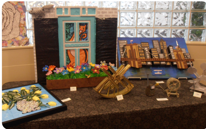
TrashedArt 2018 Winners

Entries must be original artwork, no larger than 2.5' by 2.5' by 2.5' and no heavier than 10 lbs. Any art medium is acceptable, as long as a minimum of 75% recycled content is used. Some examples of recycled content include metals, paper, rubber, glass (but no