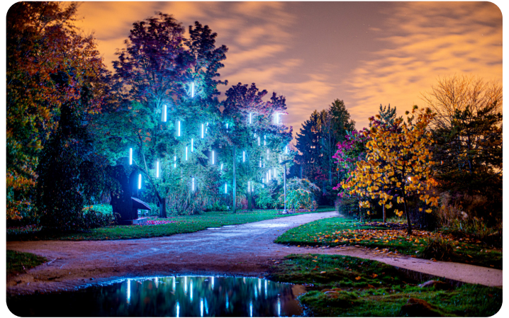
Night Form's 'dream.glitch' exhibit.

visual exhibition offers new perspectives on these works and multi-dimensional space. Building on the excitement generated during the last two years of collaboration with Klip Collective, this year's Night Forms season brings back more than a dozen installations from last year's Infinite Wave , along with a reprise of Froghead Rainbow , one of the most popular works from Klip's inaugural project, dreamloop , located in the site's Amphitheater. Viewers become participants by engaging in interactive moments that cause ripple effects through the installations. In the