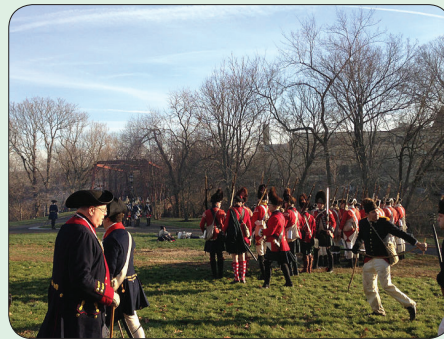
S. Broad St and Assunpink Dr., Mill Hill Park

On the morning of January 2nd, British and Hessian troops under General Cornwallis marched to attack the American troops in Trenton from Princeton along the post road, which is now the path of Rt. 206. An important delay in their movements occurred