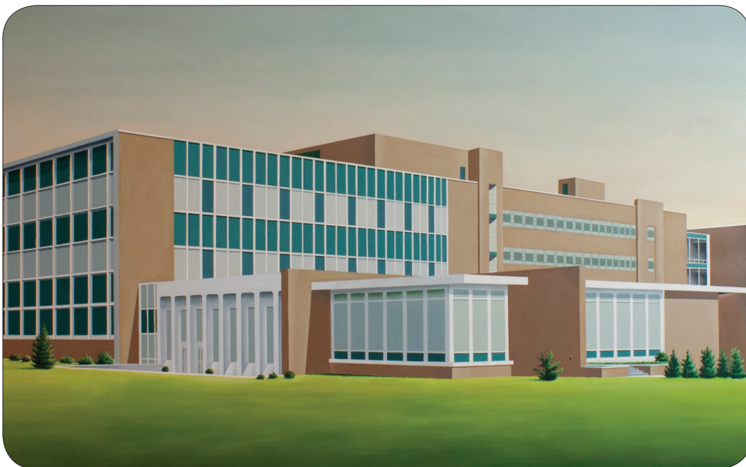
Clarence Holbrook Carter, David Sarnoff Research Center, 1967. Oil on canvas. The David Sarnoff Collection.

first blue LED, which led to the creation of an installation for the exhibition that features more than 50 paper replicas of that original LED. Through her painstakingly crafted and detail-oriented paper reproductions, Yeh draws attention to the invisible labor behind objects.